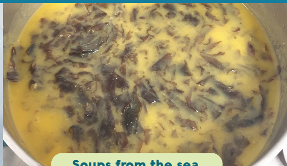
Soups from the sea